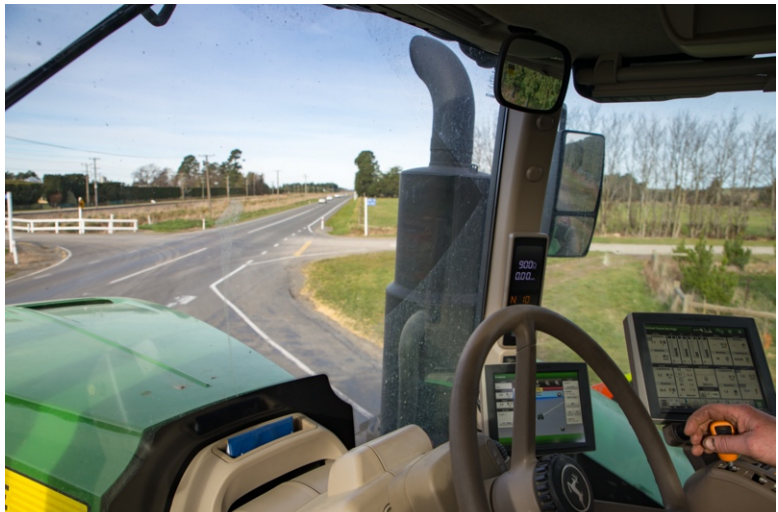
Figure 2: Farmers interact with embedded code through selectable buttons or lists on their screen.

But translating this information back into the source code originally written by the software engineers is essentially impossible.<sup>71</sup> That's why Apple,<sup>72</sup> HP<sup>73</sup> and others freely make embedded code available for their products in the form of firmware updates.