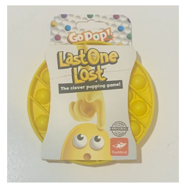
FoxMind's GoPop! has led to numerous knockoff toys.

The GoPop! toy's packaging has a label saying "WARNING: CHOKING HAZARD! Not suitable for children under 3 years." PIRG toy researchers found a listing called 2 Packs Pop Fidget Sensory Toys that does not include an age warning on the listing or the packaging.<sub>37</sub>